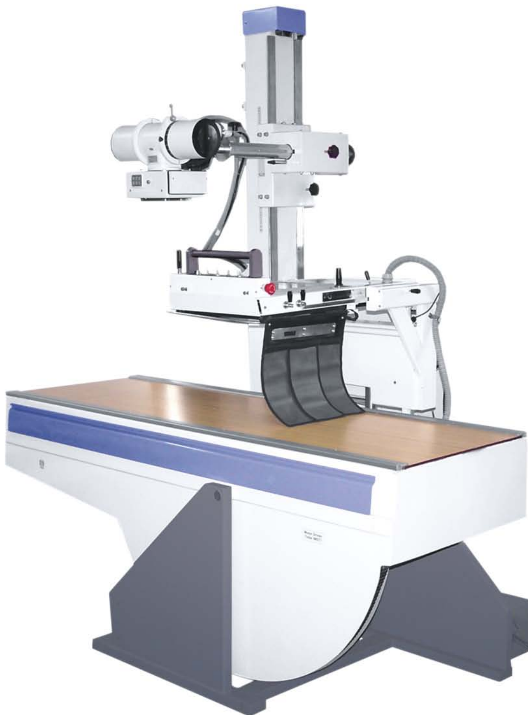
Motor Driven Table

300/500mA-125KVP, Full Wave Rectified X-Ray Generator with Rotating Anode X-Ray Tube for Rad only / Rad + Fluoro applications.