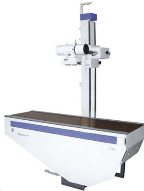
MPT Multi position (manual hand tilt) examination table with floor to ceiling tube stand has predefined 5 positions which is useful for various radiographic applications.