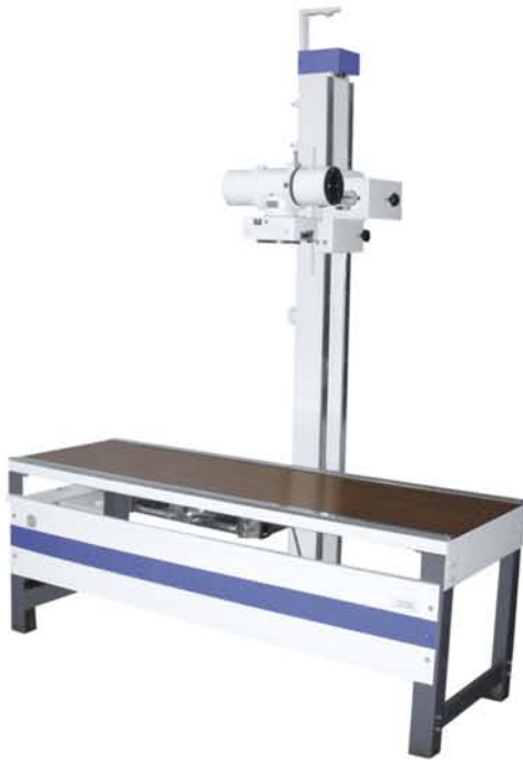
HRT Horizontal Table with floor to ceiling tube stand