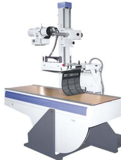
MDT All position (motor driven) examination table with floor to ceiling tube stand can tilt easily to any position (from trendelenburg to vertical) due to its motorized movement. This is an ideal combination for all kind of radiographic/fluoroscopic applications